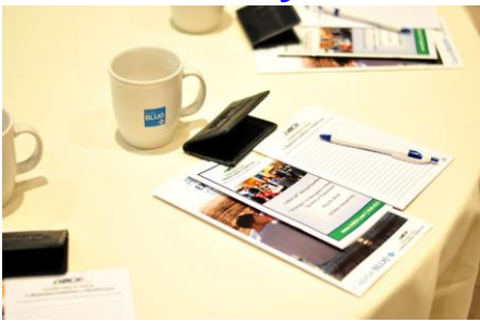
Photo Gallery of 2014 Annual Conference