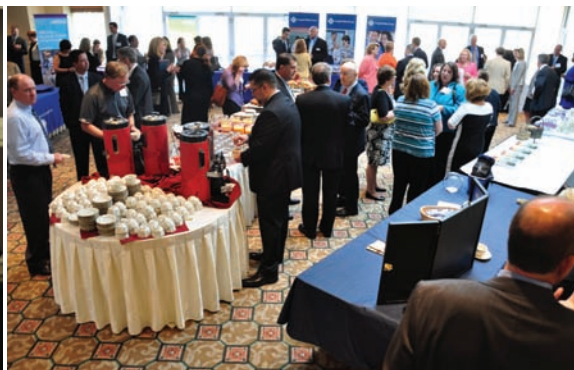
Program booklet and guests