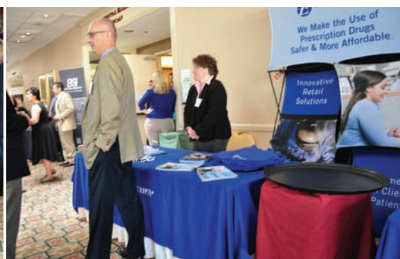
Attendees networking and visiting our sponsors