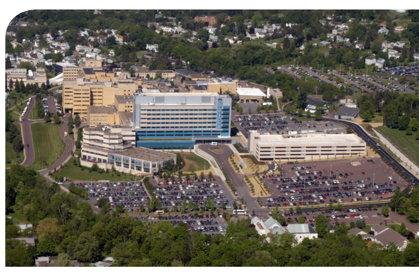
Geisinger Medical Center's campus in Danville, PA

Several successful initiatives, including the ProvenCare® "warranty" programs and ProvenHealth Navigator® advanced medical home, have come from balancing the provider and payer components. These programs have resulted in healthier, happier members and patients.