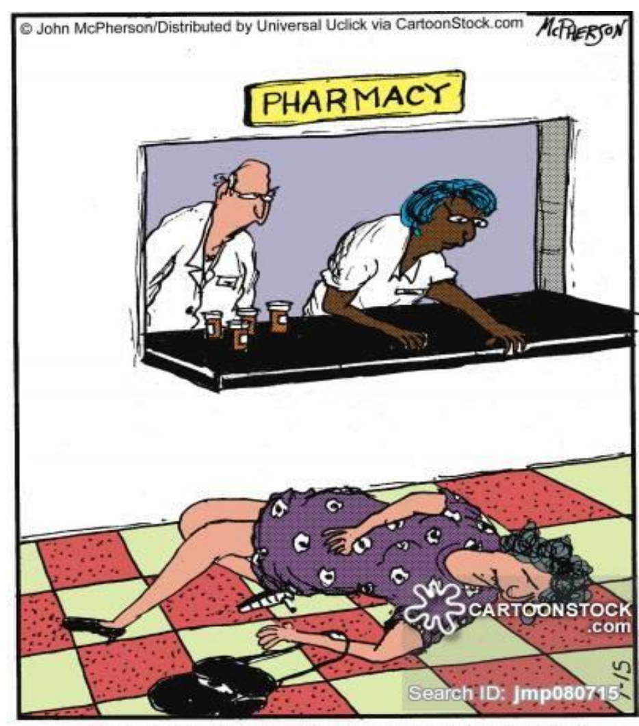
"She's going to need a prescription for light-headedness. She fainted when I told her how much her meds cost."