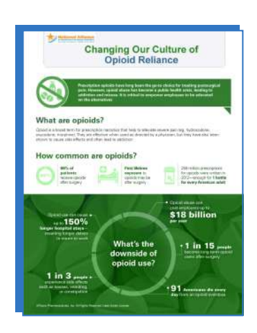
Infographic on Opioids