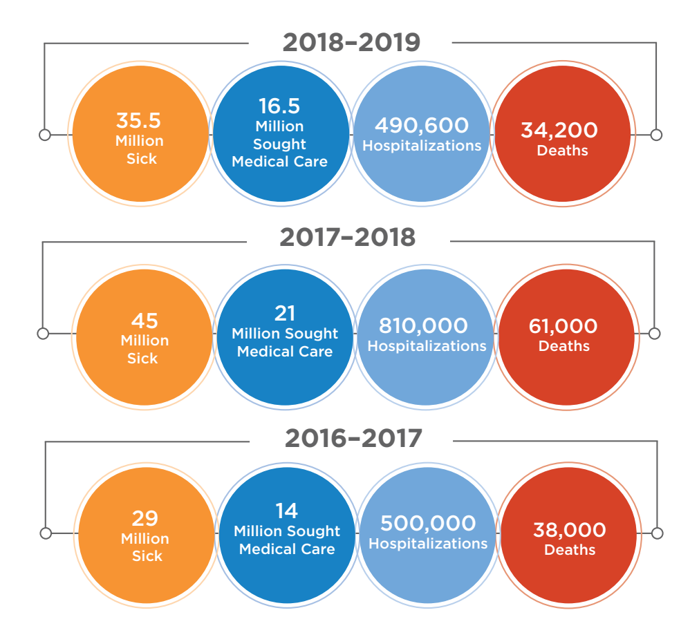
FIGURE 1. FLU SEASONS 2016–2019<sup>1</sup>

The annual toll of the flu is profound. It is estimated that 35 million Americans became sick from the flu and more than 34,000 died from it in 2018-2019. The flu season previous to that was significantly worse: 45 million people became sick and 61,000 died (see image).